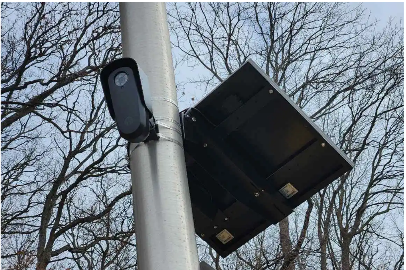
A surveillance camera mounted on a light post along N Dubuque Street in Iowa City, just north of Mayflower Residence Hall.